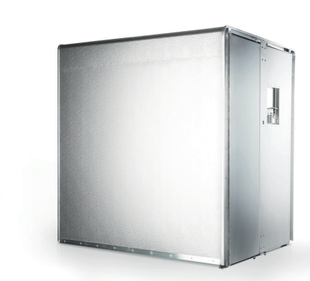
Aluminium transport box - 1,5 m<sup>3</sup> Size: 1300 × 1000 × 1200 mm (L×W×H)

Smart transport box - 2,0 m³ Size: 1549 × 993 × 1379 mm (L×W×H)