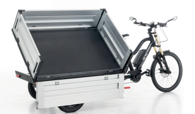
Tiltable loading platform Size: 1388 × 972 × 348 mm (L×W×H)