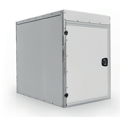
Smart transport box - 1,5 m<sup>3</sup> Size: 1300 × 993 × 1379 mm (L×W×H)

Smart transport box - 2,0 m³ Size: 1549 × 993 × 1379 mm (L×W×H)