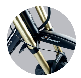
Double-bridge suspension fork Cargo-optimised