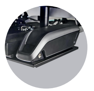
Dual battery system to double the range